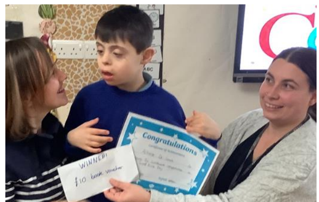
Congratulations to Acheron in Primary who won a £10 book voucher!